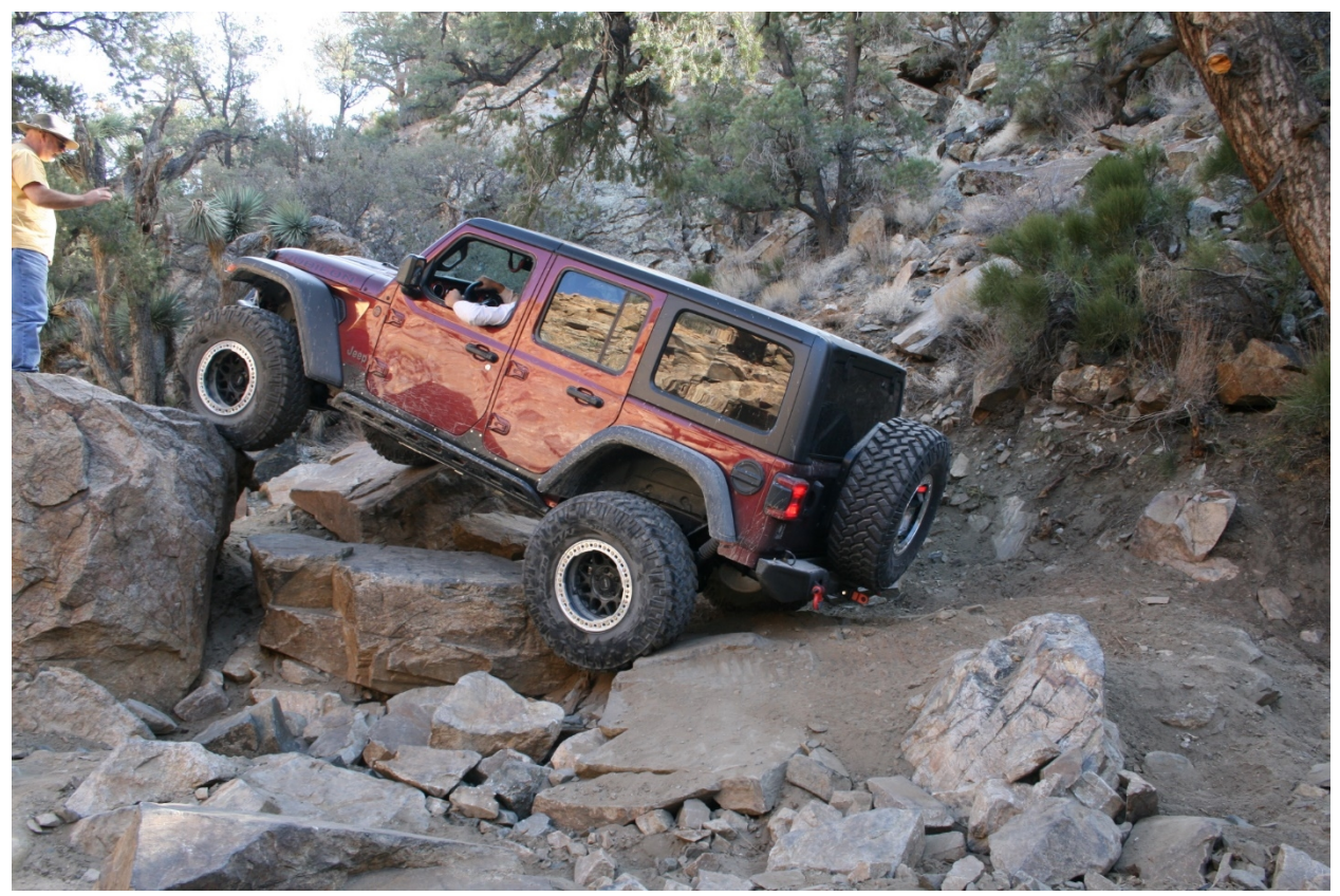
Extreme obstacle near the beginning of Motina

Matino wash is a very narrow canyon with lots of rocks, some as big as a Jeep, some as big as a tire. In several areas the driver is able to pick more than one way to travel. The most difficult sections are right at the beginning of the trail. We all made it through the first section without a problem.