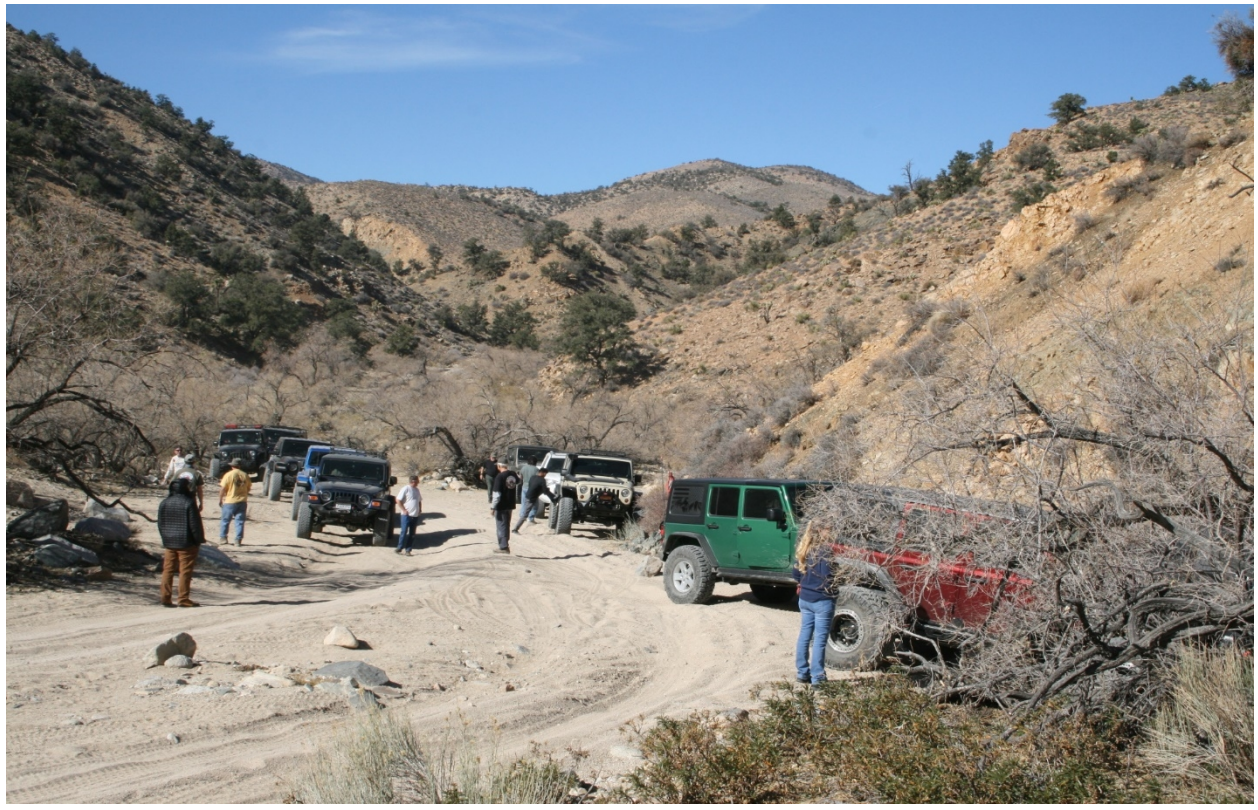
Rattlesnake trail right at the start of Motina

The Rattlesnake trail is fun and unique. The trail starts in the desert and ends at 8000ft in the forest. The first part of the trail is a wide sandy wash. The trail gets narrow and tight in spots as we climb to higher altitude. Along the way there's some optional sections to play on. A few people in the group tried the optional sections without any problems.